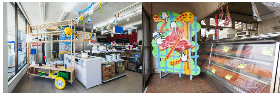
Installation in abandoned houses and shops