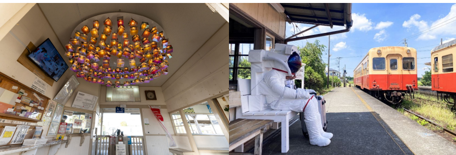
Installation in stations